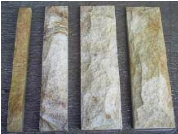
GOLDEN PALIMO-CLADDING STRIPS