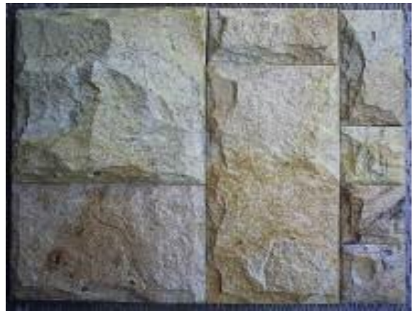
GOLDEN PALIMO-SPLIT FACE CLADDING