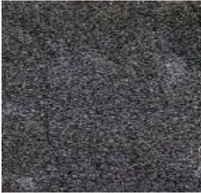
BLACK LAVA STONE